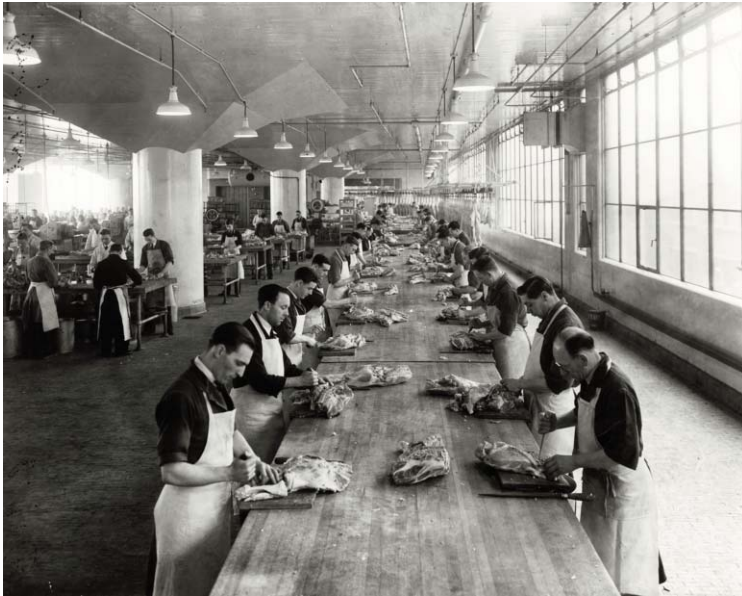
Sainsbury factory. Boning hall.

Production was organized vertically. The basement held the curing cellar, storage, pigs' heads and brisket boning, the boiler room, and a paternoster elevator that ran on pulleys in a circular motion. The ground-floor loading bay spanned the full 26-meter width of the building. There, pig carcasses and raw goods were unloaded and moved to the upper floors by lifts, and final goods were sent down for packaging via lifts and gravity chutes. The fourth floor housed the meat kitchen, and the third floor was the Holy of Holies. It featured a seasoning room for storing garden-grown fresh herbs, as well as ovens and grinding machines.