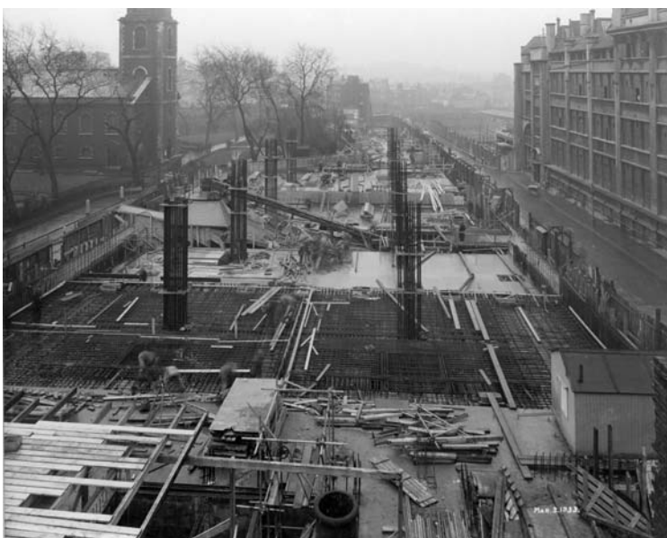
Sainsbury factory in construction.

Williams saw concrete as a universal material representing the future that provided factories with obstruction-free spaces in the form of a "shell surrounding a process." In the heart of the industrial city, he designed a six-story, 46,000-square-meter building on an irregularly shaped site along Rennie Street in Blackfriars. By using 25-centimeter-thick, flat-slab concrete floors supported on pyramidal mushroom columns that had a folded Cubist quality (1.5 meters in diameter for the basement and decreasing in diameter on the upper floors), Williams was able to design the structure with a regular, 13-by-11-meter grid and 4.5-meter floor-to-floor heights. Steel casement windows with translucent upper panes filled the structural framework with diffused light. The central section of the roof contained glass round lights set in concrete, as a skylight, and the interior had partitions in metal and glass. The factory was built in two phases: the main building and an annex. Seemingly, form followed function in every detail, including the hygienic, easy-to-clean tile floors.