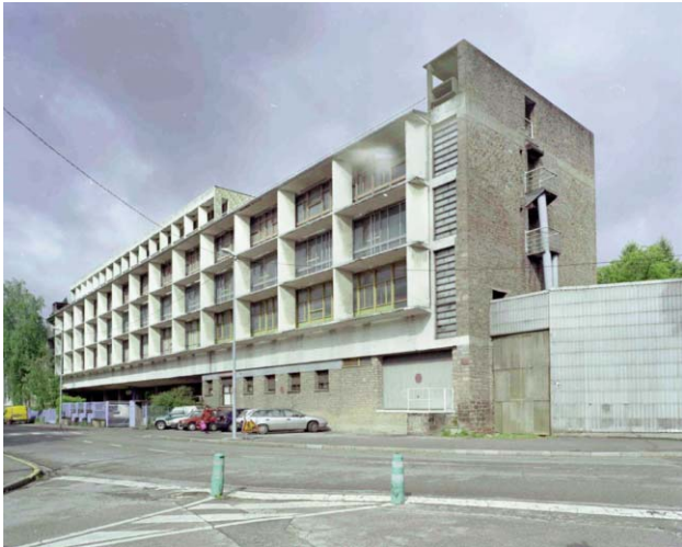
Duval factory. Exterior and terrace.