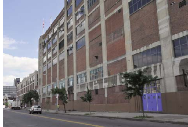
Pfizer factory. Back side with ducts, exterior and functional diagram.