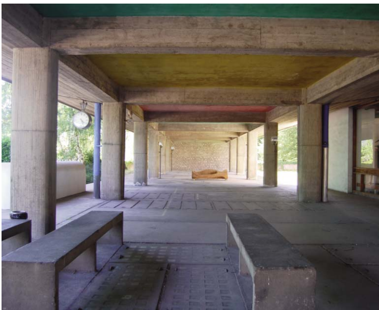
Duval factory. Open ground floor and interior double height space.

With the Usine Claude & Duval, Le Corbusier employed his architectural devices of Modernist distinction including the "Modular", based on human measurements and the Golden Section, pilotis , the ribbon window, the roof garden, and the concrete brise-soleil . After three project design concepts, the Duvals with Le Corbusier, organized the factory production as a model. The raw materials and textiles would be delivered by electric lift to the third floor and then descend level by level, for each operation until the completed project was shipped out for distribution at the ground floor. The pilotis lifted up main volume so that the ground floor was open for storage of the workers' bicycles.