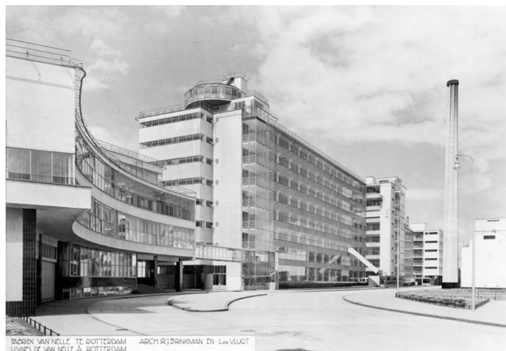
FABRIEK VAN NELLE. TE ROTTERDAM USINES DE VAN NELLE À ROTTERDAM ARCH.(R)BRINKMAN EN VAN DER VLUGT