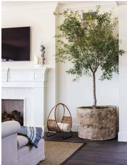
Figure 3: A potted olive tree enhances the elegance of this modern interior, blending natural elements with contemporary design. The use of a rustic stone planter adds texture and character to the space.

Nonetheless, a more recent study conducted at Drexel University concluded that potted plants have a minimal contribution to improving indoor air quality since they absorb pollutants at a slow rate (Cummings & Waring, 2019). In a similar vein, the American Lung Association noted that while plants can enhance indoor health in other ways, we should not rely on them primarily to clean indoor air (American Lung Association, 2021). Nevertheless, plants are still highly valuable in terms of their psychological benefits in indoor spaces. Some studies show plants help create better focus, reduce depressive symptoms, and decrease overall anxiety levels (Bringslimark et al. 2009). Olive plants, in particular, might contribute to a more calming, centered environment due to their graceful, flowing leaves and cooler-toned foliage; they create a perfect addition to interiors focused on relaxation and health (Piedmont Healthcare, 2021).