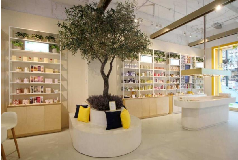
Figure 1: Mediterranean olive tree as a central decorative element in L'Occitane's retail space, enhancing the ambiance with a natural and Mediterranean aesthetic.

Therefore, they are ideal for those concerned with conserving water. Live plants instead of artificial ones contribute to a greener and more eco-friendly living space (International Olive Council, n.d.). Practical Uses in Interior Design The olive plant will be versatile in interior design applications. They work great as focal points in large pots placed in living rooms and entryways. Use an olive branch in a vase, or place a small version in pots on tables and shelves to bring the outdoors in, adding touches of subtle beauty to a kitchen, bathroom, and even a home office.