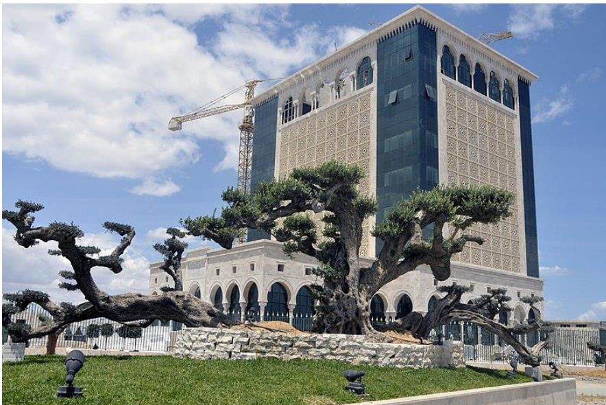
Figure 4: The headquarters of Zitouna Bank in Lac II, Tunisia, features centuries-old olive trees, showcasing the integration of cultural heritage with modern architecture.

Furthermore, In public spaces, olive trees are increasingly found in parks, squares, and pedestrian zones, bringing beauty and shade. With the increased pressure of establishing sustainable urban areas, even urban planners are reverting to the use of olive plants, especially for cities with limited water resources, due to their ability to survive under harsh conditions. Its resilience to drought and low water requirements make it an excellent option for cities that need to create green spaces while conserving water (Georgopoulou & Tsoutsos, 2018).