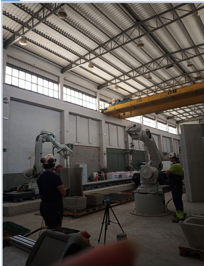
Fig. 2. Fabrication of printed specimens at the ACCIONA laboratory