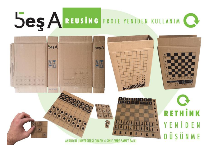
Figure 9. Emre S., Brain game design 2019, (writer's archive)

The eighth project was a design by Rukiye Erdoğan and it was designed from a box used to carry white goods. The surface of this box was reused and turned into a light powered by solar light. She created this three-dimensional product by using only the outside of the box and by folding it without any glue. She also added a part that works with solar power to save energy and this innovative approach took the product to the next level (Figure 10).