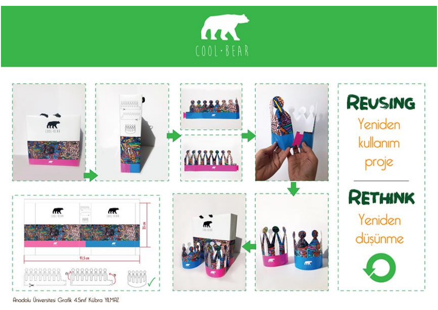
Figure 7. Kübra, King and queen crowns for children design, 2019, (writer's archive)

crowns for boys and girls. The crowns were made by a cutting and folding method using the paper bag's own colors (Figure 7).