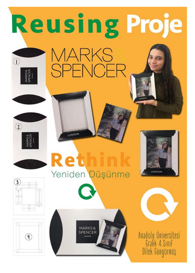
Figure 8. Dilek, Photo frame design, 2019, (writer's archive)

The seventh project was a design made from a box of a company producing food products by Emre Samet Balcı. The surface of it was turned into a play board. In this way he created a product for individuals from every age using only one color and one shade. It both entertains and makes the user think (Figure 9).