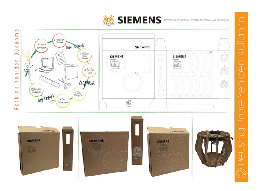
Figure 10. Rukiye, Solar powered lighting design 2019, (writer's archive)

The nineth project is a design by Veli Çelik and it was created from a fluorescent light tube box of a company producing lighting products. The original function of the box is to carry fluorescent lights and the surface of the box was reused and turned into a toy truck for kids. It was made by a process of folding without using glue or extra colors as the original color was maintained. This project used the same material as the sixth project, yet different designs were created (Figure 11).