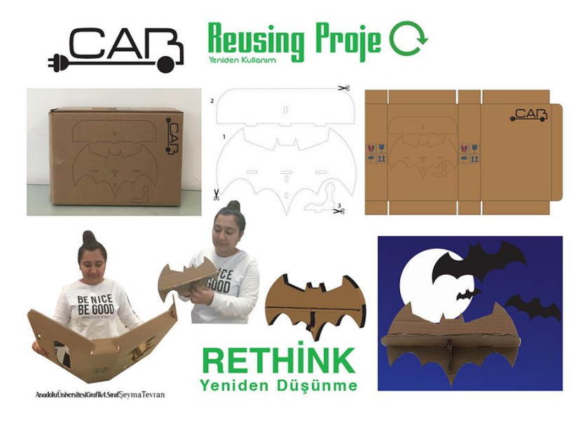
Figure 12. Şeyma, Shelf with superheroes on it 2019, (writer's archive)