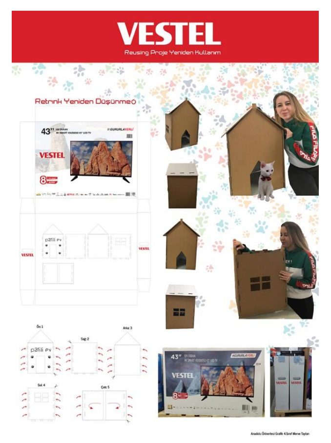
Figure 5. Merve, Animal shelter design, 2019, (writer's archive)

The third project was done by Merve Taylan and an LED TV box was used. The actual function of the box was to carry LED TVs but it was turned inside out for reuse. In the end the box was turned into an animal shelter by cutting and folding it, without glue (Figure 5).