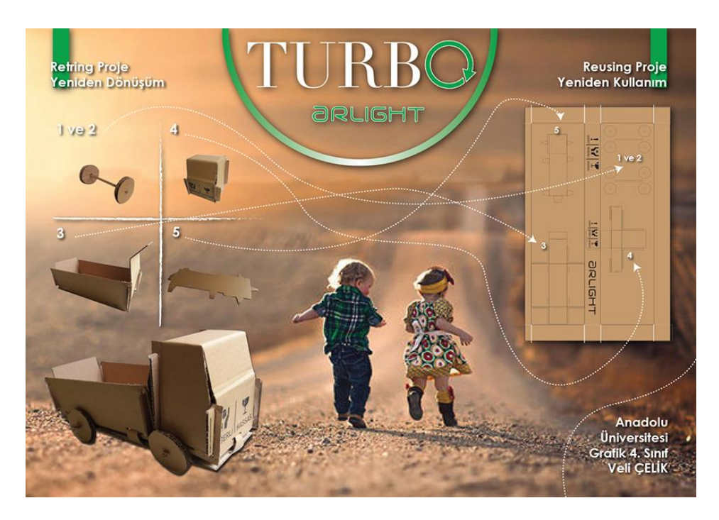
Figure 11. Veli, Toy truck design 2019, (writer's archive)

The tenth and the last project was a design by Şeyma Tevran and it was made from a box used by a company producing technology products. The first function of the box was to carry cables and the surface of it was reused to make a shelf with pictures of superheroes for children. The shelf has the same colour as the box and, just like in the other projects, the use of glue was avoided (Figure 12).