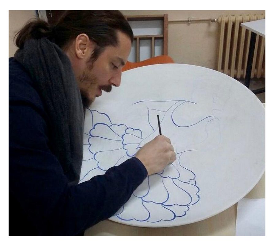
Figure 13. Can Gökçe. 2017.

In figure 14, a tile plate reflecting today's woman is seen. While the tile décor applied with a completely black sable brush is seen on the background, there is a contemporary female figure in thecenter. In the study, the position of women in society is addressed. It is seen that the artist's own senses are fictionalized on a traditional structure, completely moving away from the traditional tile interpretation. It is a work with under-glaze décor with a sable brush on a ready-made ceramic platewith a diameter of 25 cm and glazed firing at 930 °C.