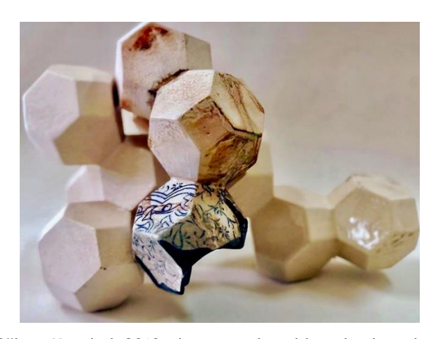
Figure 18. Can Gökçe, Untitled, 2019, shaping with mold, underglaze decoration, unit size 5x5x5cm. Can Gökçe photo archive.