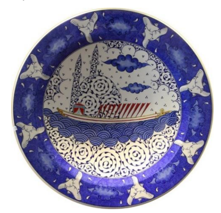
Figure 2. Can Gökçe, Sultanate Boat in Ortaköy, 2009, tile body,underglaze decoration, 930 °C glazed firing, R: 65cm.

In figure 2, we intensely perceive our traditional motif in the form of spiral vines, consisting of simple, small-leaved flowers, blue-colored, defined as the Haliç work since it was first foundin the Haliç, and we see the Chinese clouds and bird figures on the edge of the plate. The Bosphorus view and Ortaköy mosque were applied in tile technique with the sultanate boat in the center of the plate.