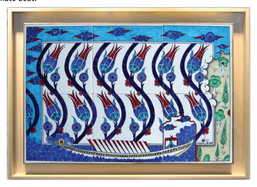
Figure 3. Can Gökçe, Iznik Tulips and Sultanate Boat, 2009, tile body, underglaze decoration, 50x70x5 cm.

Figure 3 shows a 50x70x5 cm wall panel. It can be seen that Chinese clouds and cypress tree motifsare also used on the panel, on which tulip motifs are used prominently. Small spirals, which are generally used on plate edges and borders, are used to give a sea wave effect. The wall panel is completed with a stylized sultanate boat.