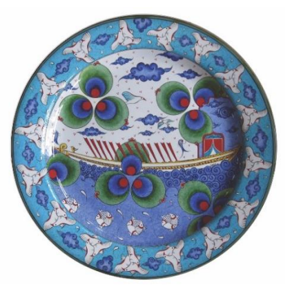
Figure 1. Can Gökçe, Sultanate Boat With Çintemani Motif, 2009, tile body,underglaze decoration, 930 °C glazed firing, R: 82cm.

In figure 2, we intensely perceive our traditional motif in the form of spiral vines, consisting of simple, small-leaved flowers, blue-colored, defined as the Haliç work since it was first foundin the Haliç, and we see the Chinese clouds and bird figures on the edge of the plate. The Bosphorus view and Ortaköy mosque were applied in tile technique with the sultanate boat in the center of the plate.