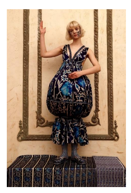
Figure 8. The use of the work in figure 5 on the costume.