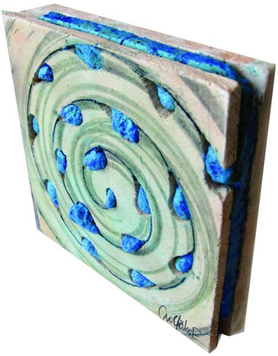
Figure 16. Can Gökçe, Egypt 1, 2010, openwork and Egypt Paste technique, 15x15x3cm.

In figure 17, the form created by repeating the unit consisting of 6 squares and 8 hexagons, definedas truncated octahedron in geometry, is seen (http-3). Unit model is produced by drawing in 3D software. The form, which was inspired by the pattern and form mentality of Edirne Muradiye Mosquetiles, exhibits a dynamic structure, underglaze décor was applied, and glazed firing was performed at1150 °C. In figures 18 and 19, two different forms formed from the same unit are seen. In these works, underglaze decoration was applied, and glazed firing was performed at 1150 °C.