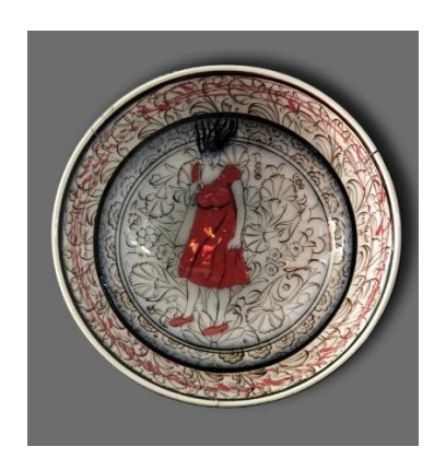
Figure 14. Can Gökçe, Woman in Red, 2013, tile body, under glaze decoration, R: 25 cm.

In addition to ceramic plates and panels, we see the traces and reflection of tile patterns in theirthree-dimensional forms. Two different forms are seen in figures 15 and 16. The common features of these forms are that the upper part has spiral folds made using the openwork method, which resembles the Haliç Style, and the use of blue "Egypt Paste" between the surfaces. In the works, the "Haliç Style" motif was combined with Egypt Paste and came to life again in the form of a bowl. Inaddition, single firing was applied at 950 °C.