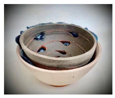
Figure 15. Can Gökçe, Untitled, 2018, openwork and Egypt Paste technique, R: 14cm.

In addition to ceramic plates and panels, we see the traces and reflection of tile patterns in theirthree-dimensional forms. Two different forms are seen in figures 15 and 16. The common features of these forms are that the upper part has spiral folds made using the openwork method, which resembles the Haliç Style, and the use of blue "Egypt Paste" between the surfaces. In the works, the "Haliç Style" motif was combined with Egypt Paste and came to life again in the form of a bowl. Inaddition, single firing was applied at 950 °C.