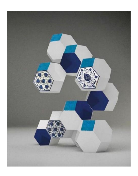
Figure 17. Can Gökçe, Muradiye, 2020, 3D Design, underglaze decoration, unitsize 5x5x5cm.