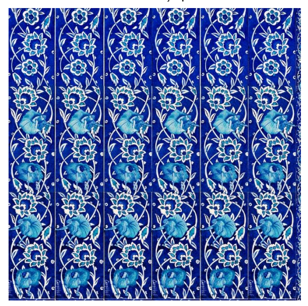
Figure 6. The work in figure 5 is printed on silk fabric.