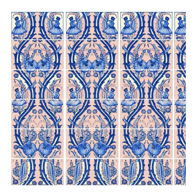
Figure 10. The work in figure 9 is printed on silk fabric.