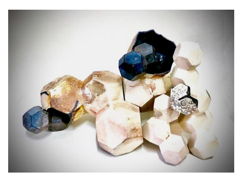
Figure 19. Can Gökçe, Untitled, 2019, shaping with mold, underglaze decoration, unit size 5x5x5cm.