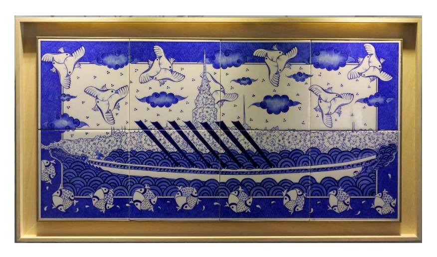
Figure 4. Can Gökçe, Sultanate Boat in Front of Kızkulesi, 2009, tile body, underglaze decoration, 50x70x5 cm.

Turkish Tile (çini) motifs, which are Turkish cultural heritage, affect not only field of ceramic, but also other fields of art and joint work areas are born. As the French philosopher Voltaire quoted "All the arts are brothers, each one is a light to the others", all fields of art actually support each other and are related. The works created as a result of projects carried out with different disciplines create an environment that supports innovation and creativity. In this context, Can Gökçe's interpretation, inspired by Iznik tiles and Edgar Degas' ballerinas, came to life by printing on silk fabrics in the 4th Wearable Art Collection, prepared by fashion designer Başak Cankeş. As a result of a work process that lasted for 4 months, original designs emerged. Images 5, 6, 7, 8, 9, 10, 11 and 12 contain selected examples from these works.