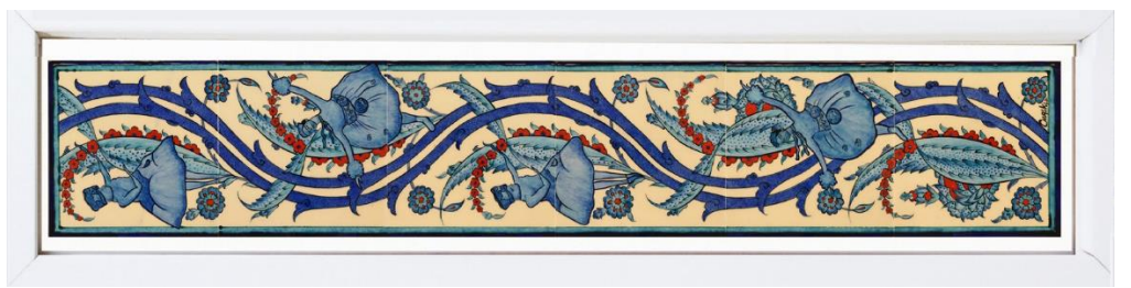
Figure 9. Can Gökçe, Degas in Nicea, 2017, tiles, under glaze decoration, 10x60x5 cm.

Figure 9 has a 10x60x5 cm wall panel. The panel shows the aesthetic unity of the Saz Road motif, large dagger leaves, paw motifs obtained by stylizing a bird's eye view of a flower and ballerina figures. The design is patterned with tile paints on the tiles, and glazed firing is applied at 930 °C. Infigure 10, the design is printed on silk fabric, and in figure 11, it is transformed into a garment.