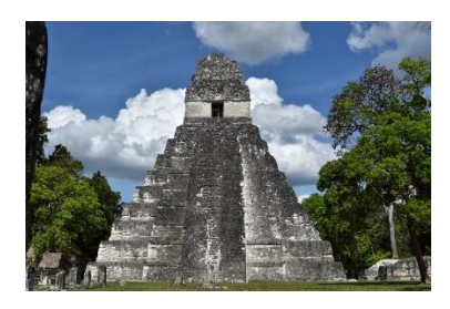
Figure 2. Jaguar temple, Tikal, Guatemala

The references presented show a brief summary of the many comprehensive fundamental lessons from antiquity. Such fundaments should be embedded in all the stages of the construction education from the early years of study to enable the formation of construction participants with an integral and broad perspective aware of the value of ancient learnings along with the opportunities, risks, and learning present in every epoch.